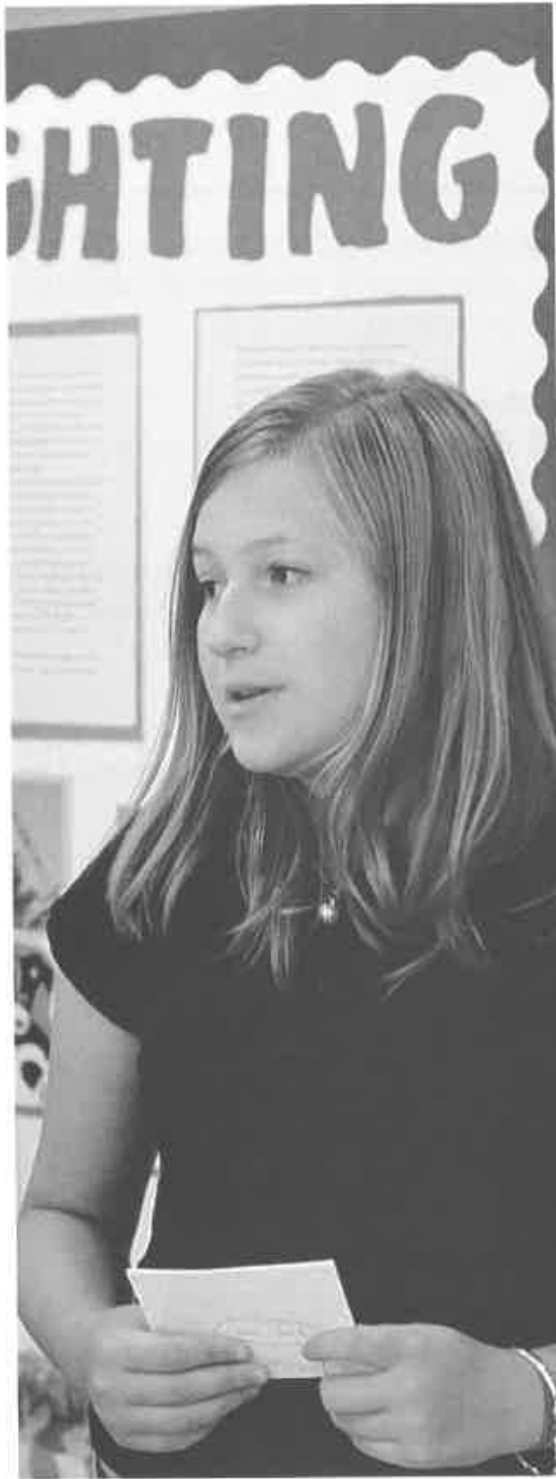
What are some ways that you can participate in our government?