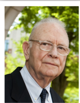
Lee H. Hamilton

Engaged citizens are the foundation of a well-functioning democracy. They get involved. They understand the world around them. They care about their communities and work to improve them. In so doing, these citizens practice civility when faced with differences of opinion. When we are informed and recognize our differences (and similarities) we are taking the first steps toward a dialogue that is both substantive and factual, while simultaneously promoting civic health. Retired Congressman Lee Hamilton notes: